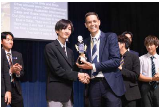
Girls U18 Volleyball Trophy

On the 30th of September, the Epsom Volleyball Team went to Oasis International School to participate in the Jungle Jamboree Volleyball Tournament 2023. In a decisive 2-0 victory in the Finals against Grace Volleyball Academy Team A, our Epsom team managed to pull off a win after losing to the same team in the second round of the group stage, which got our team bumped down to the Losers Bracket, making our team play an extra match, fatiguing all our players. Winning 2-0 in all matches in the Losers Bracket, our team reunited with the team that beat us once in the Finals, and pulled off a resounding 2-0 victory to cement us as champions of the 2023 Jungle Jamboree!