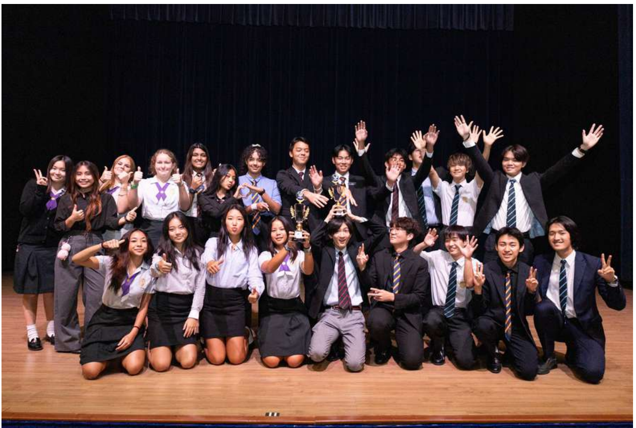
-VOLLEYBALL TEAMS U18-