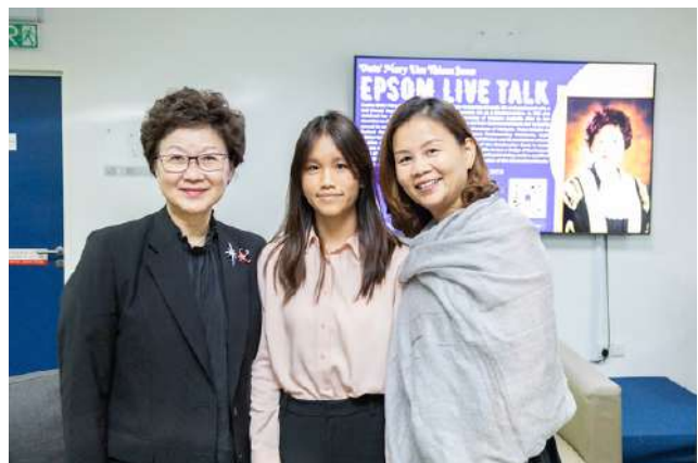
- EPSOM LIVE TALK - - JUSTICE DATO MARY LIM -