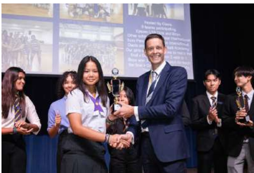
Girls U18 Volleyball Trophy