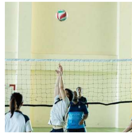
A SPORTS SOCIETY EVENT