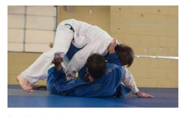
Brazilian Jiu-Jitsu FEE: RM800 per student, per term

A grappling martial art involving the use of throws, takedowns, and ground control positions leading to chokes and joint locks.