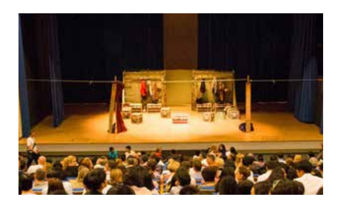
Theatresports™ & Improv Club

This club challenges points of view and expresses opinions. It creates an evening of theatre that engages the audience in a way that makes them respond openly, as one might do at a sporting event, and has them thinking and talking about the performance afterwards.