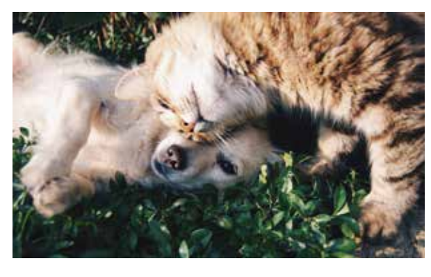
RSPCA (Animal Welfare)

Make a change by supporting and protecting of the health and well-being of animals by actively educating and fundraising.