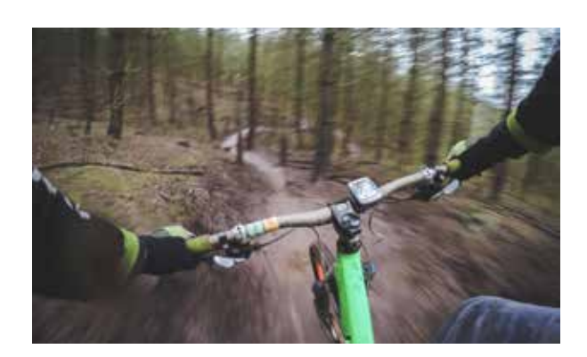
Off-road cycling FEE:

The sport of riding bicycles off-road, often over rough terrain, using specially designed mountain bikes. There is a fee to rent a mountain bike from a nearby shop or you must be able to bring your own mountain bike.