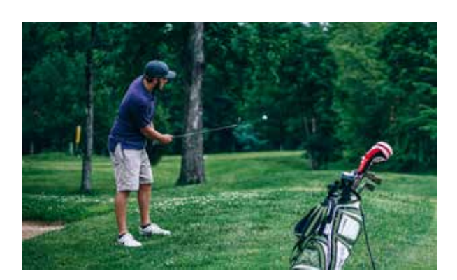
Golf (Paid activity) Fee: RM500 per term

A club-and-ball sport in which players use various clubs to hit balls into a series of holes on a course in as few strokes as possible.