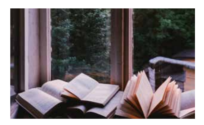
Drop Everything and Read (DEAR)

A celebration of reading designed to remind people of all ages to make reading a priority activity in their lives.