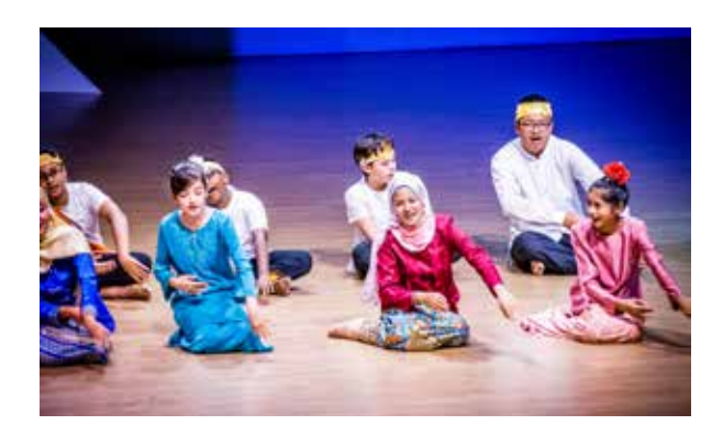
Malaysian Culture and Performing Arts

Learn the amazing dances and performing arts from Malaysia and be part of an inclusive and diverse culture.