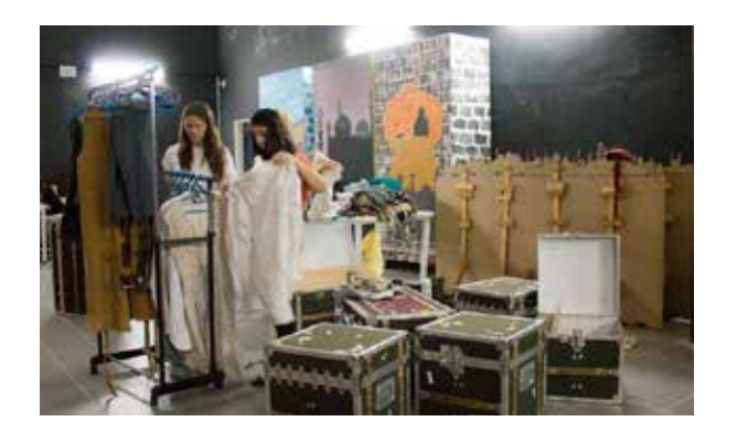
Stage and Costume Crew

An excellent chance to support the members of the school play by creating props, costumes and displays to make the show an even bigger success.