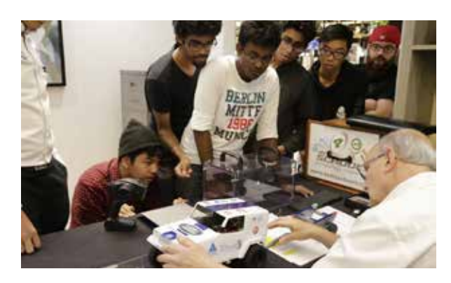
National Robotics Open Competition

A competition to create a functioning robotic prototype using a variety of engineering techniques and materials.