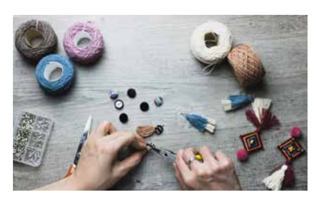
Craft, Design and Make

Learn to think and act as artists, makers and designers, working creatively and intelligently.