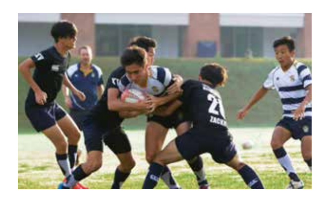
Boys' Rugby with KL Tigers

A team sport that delivers significant social and health benefits. It can also be a physically demanding sport and players should be physically and mentally prepared, and understand how to play safely.