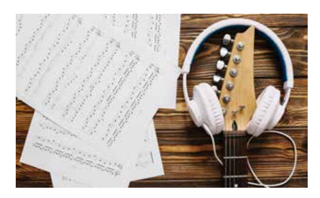
Grade 5 Music Theory & Music Tech Club

An opportunity to work towards examinations and understand the processes involved with producing music.