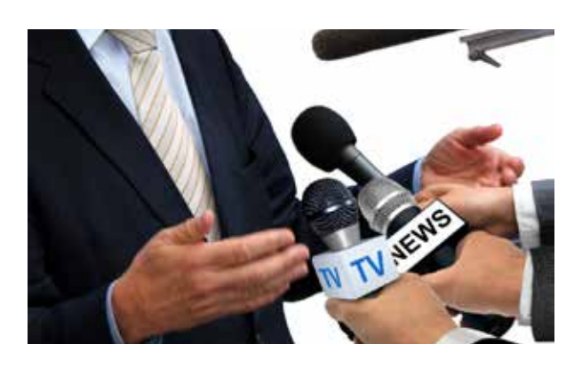
ECiM Roving Reporters

A reporter who travels around, rather than staying in a fixed place, collecting interesting stories and information to create a newspaper article. To work closely with the 'ECiM Editors'.