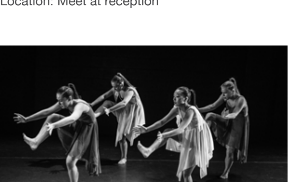
Dance FEE: RM450 per student, per term

Dance therapy and choreographed dance routines in a variety of genres. An opportunity to work as part of a team, whilst improving fitness levels.